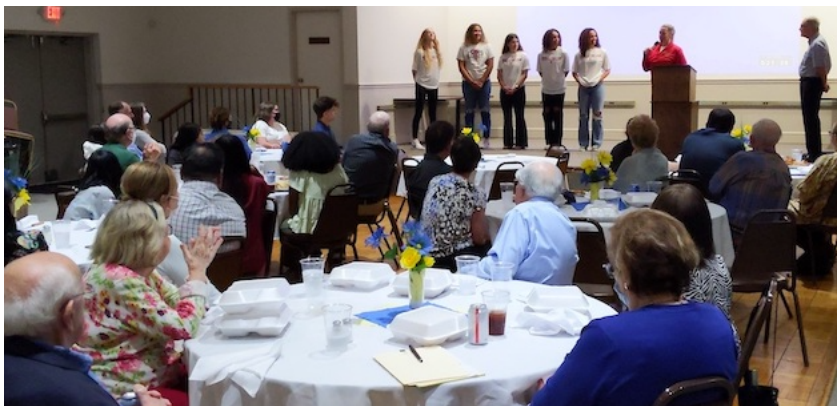
The coach and members of Madison High School Girls Basketball Team were honored at our JOI Club recognition dinner for winning the state championship three consecutive times.

“Volunteers are the only human beings on the face of the earth who reflect this nation’s compassion, unselfish caring, patience, and just plain loving one another.”